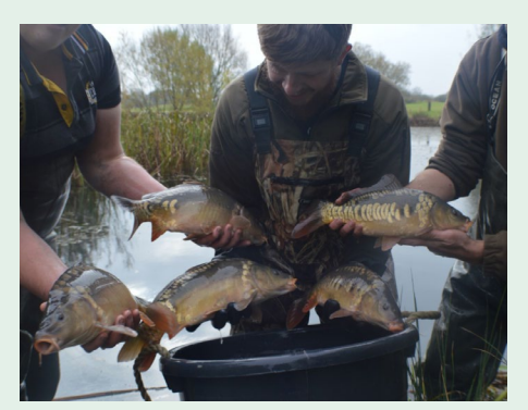
A good haul of carp