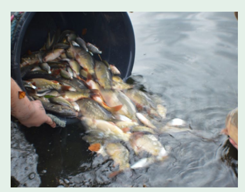
Juvenile carp being introduced to the lakes

There are a few posts and mentions on social media about pike in the lakes. This is correct, pike will be in all our lakes. We are not a commercial fishery. Pike are natural to the environment, the Environment Agency support this fully and it serves to provide a balance to the lake and a different form of fishing, especially in winter months.