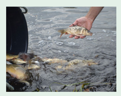
Some lovely examples going into Merlin Point Lakes...