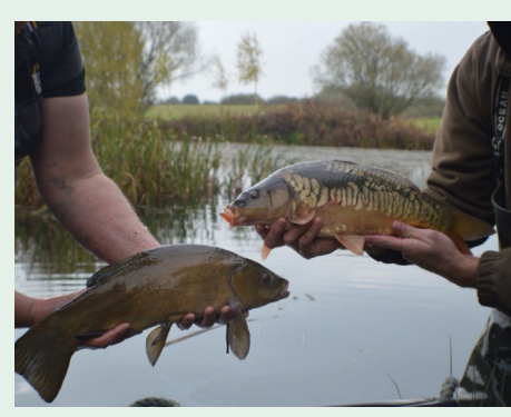
The odd tinca tinca can also be found